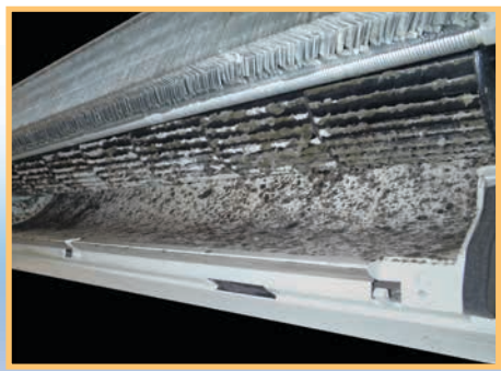
Mold thrives on mini-split blower wheels