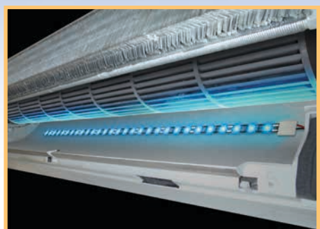
Mini UV LED inhibits mold growth, extends mini-splits life, and is quick & easy to install.