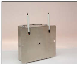
Internal mount electrode position

Positive and negative ions are emitted from the two adjustable electrodes. A magnet is provided for attaching the unit internally.