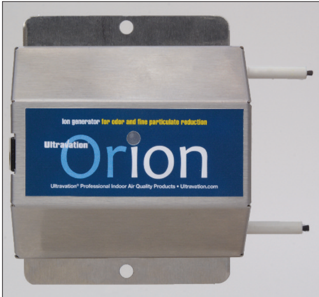
Adjustable electrode position for internal or external HVAC installation