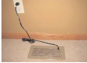
PLUG REGISTER BOOSTER INTO 115 VAC OUTLET.