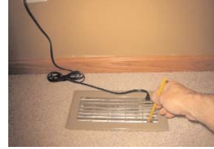
ON/OFF SWITCH IS LOCATED UNDERNEATH GRILLE.