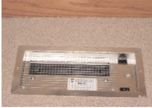
INSERT REGISTER BOOSTER INTO REGISTER BOOT. SCREW TO FLOOR.